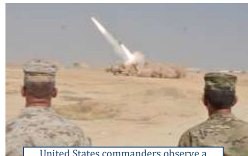
United States commanders observe a HIMARS strike near Haditha, Iraq