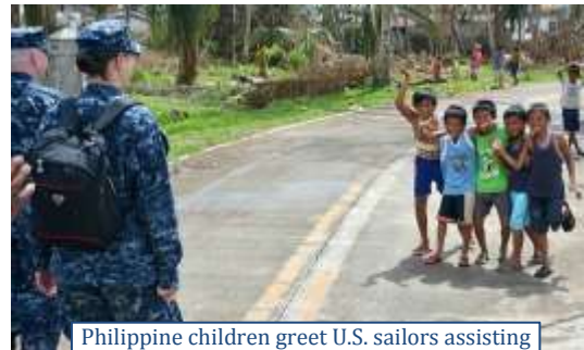
Philippine children greet U.S. sailors assisting in relief efforts in response to the aftermath of Super Typhoon Haiyan/Yolanda (CC)