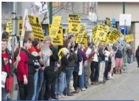
Protesters gather in Minneapolis to condemn missile strikes on Shayrat Airbase, Syria

What all of this points to is that a narrative that acknowledges the recent mistakes that have led to skepticism on the part of the U.S. public towards American global engagement, but still sees benefits to reforming the system rather than withdrawing from it, and could resonate with voters. This narrative would also need to provide a compelling assessment of what U.S. economic and security interests are as the United States prepares to enter the mid-twenty-first century.