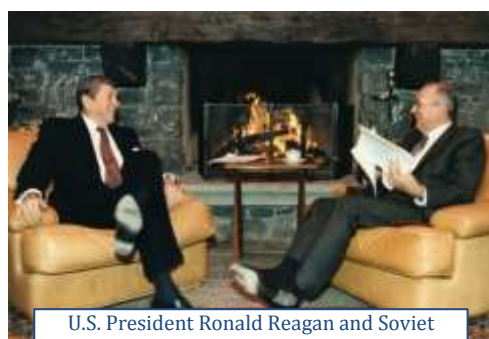
U.S. President Ronald Reagan and Soviet General Secretary Mikhail Gorbachev

There has never been an expectation that the “average” U.S. citizen would be an expert on matters of foreign policy or be conversant with the details of specific situations or events. The challenge has always been to connect U.S. grand strategy and foreign policy to an overarching narrative that speaks to the voters by providing the broad outlines of how the U.S. role in the world is connected to the interests and values of the general public. At the end